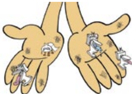
Hands after using the restroom!

Always wash your hands after using the restroom to wash those toilet germs down the drain!