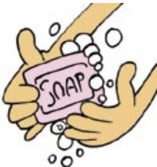
Washing hands WITH SOAP!