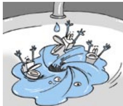
Toilet germs going down the drain!