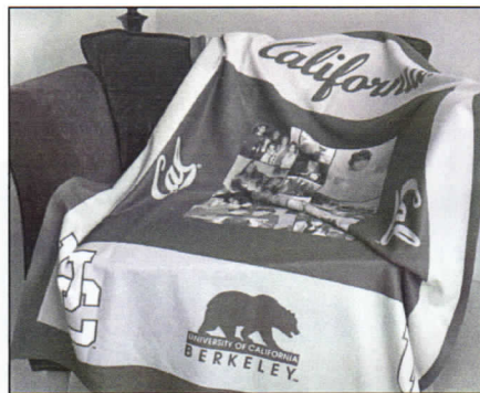
Snapfish's Collegiate Blanket

To use your photos in a Snapfish product, you can upload them from a computer to your account