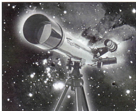
Educational Insights' GeoVision Vega 600

While today's light pollution makes it a bit more difficult to see the night sky than it was in, say, Copernicus' day, we still enjoy pulling out a tele-