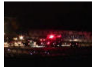
Ohio Plane Skids Off Runway