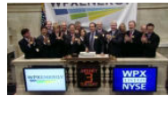
Markets cheer 2012