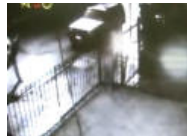
NYPD Says Suspect Admits 5 Firebomb Attacks