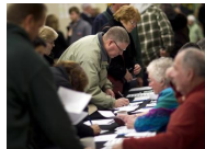
Vote Counting Underway in Iowa Caucuses