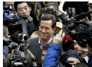
Romney, Paul, Santorum in Iowa Top-Tier