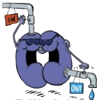
The Kidney Brothers®

The Kidney Brothers are like a water treatment plant. They need water to function at their best. You need to drink AT LEAST 6 glasses each day. Monitor your intake this week by drawing a circle around a glass each time you drink WATER. When it comes to quenching thirst and choosing a low calorie drink, nothing compares to H 2 O! At the end of the week, sit down with an adult in your family and answer the questions below.